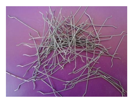
Fig. 1. Steel fibers

To make the specimens, the Portland cement, Type 2, was used in accordance with the ASTM C150 Standard. The present study used the hooked-end steel fibers measuring 50 mm long and 0.8 mm thick. Figure 1 shows the photographs of steel fibers and Table 1 shows the properties them. All the aggregates passed through No. 8 sieve, with the specific weight being 2.6 (gr/cm<sup>3</sup>). In order to achieve the required workability, the researchers used Dezobuild 10, a commercial carboxylate superplasticizer, for making the concrete. Table 2 shows the concrete mixed design used for constructing the specimens. The mixed design used for making all the specimens contained the same volume of aggregates, cement, water, and superplasticizer, with the specimens being different in terms volume of fibers and slabs thicknesses. The present study made 27 slabs reinforced with steel fibers, measuring 400 \times 400 cm, with three different thicknesses including 2.5, 5 and 7.5 cm in 9 different models (3 specimens for each model). Among the 9 models, 3 models did not contain fibers and were used as the control specimens, other models contained a 0.5% and 1% volume of fibers. All the specimens were kept at 25°c and 85% RH for 24 hours. Then, the specimens were cured for 28 days in water tanks of 20°C. After 28 days, the specimens were tested.