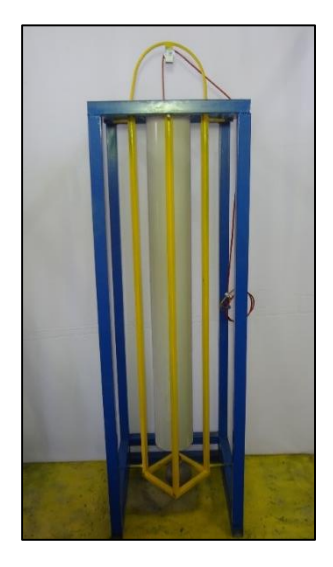
Fig. 2. Test setup of drop weight impact

the ASTM C496 Standard, was performed on the cylinder specimens with 100 mm of diameter and 200 mm of height at a loading rate of 0.05 MPa/s. The three-point bending test (the application of a concentrated load at mid-span), in accordance with the ASTM C1016 Standard, was performed on 15 bending beams measuring 320 mm long, 60 mm wide, and 80 mm high. In ultrasonic pulse velocity (UPV) test was performed on cube specimens with side lengths of 100 mm in accordance with the BS 1881 Standard with the direct method (that is, placing the transducer on both sides of the cubic specimen) has been used. In the impact resistance test, 27 slabs reinforced with steel fibers, measuring 400×400, with three different thicknesses including 2.5, 5 and 7.5 cm were investigated under the drop weight impact effects. Fig. 2 shows the drop weight impact testing machine. By means of a steel cable installed on a pulley, the testing machine used a steel ball weighing 5.8 kg. By means of the steel cable and the pulley, the ball repeatedly went up to the height of 1.5m and dropped onto the specimens. This continued up to the moment of failure development in slabs. To guarantee that the ball would precisely hit the slab center, a guiding system was used for the ball, which consisted of a cube and a plastic pipe. In this test, the number of blows required for the development of the first visible crack and for the slab destruction was recorded.